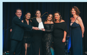
Strata Community Management Small Business Prestige Strata Management Sponsored by BCB