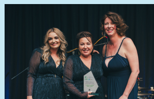
Strata Community Environmental and Engagement Award Abode Strata Sponsored by Macquarie Bank