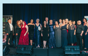
Strata Community Management Large Business Richardson Strata Management Services Sponsored by Perrott Painting