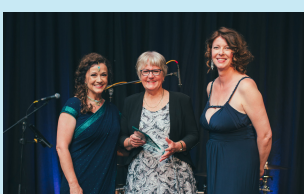
Strata Community Management Medium Business Strata Alliance Sponsored by CHU