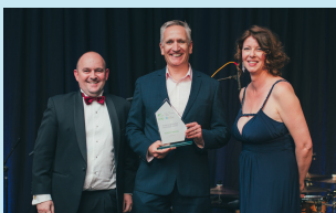
Strata Services Business Perrott Painting