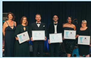
SMPS New Recipients Dominion Strata Management B Strata